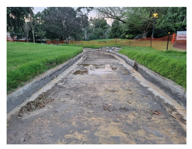
Project is rectifying subsiding riverbanks, pathways, and landscaping.

Latent conditions and bad weather has impacted on delivery.